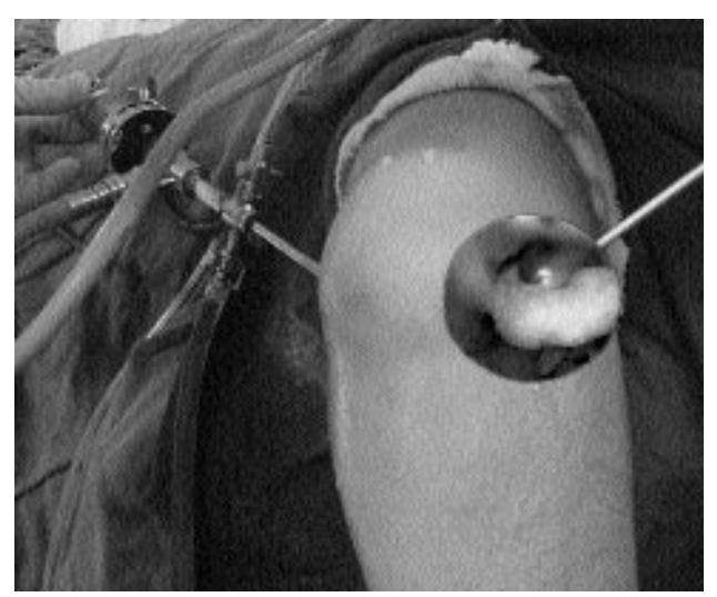
Fig. 2. Removal of the loose body with forceps.

According to the Broberg and Morrey's evaluation method, the results were excellent in two patients (28.6%), and good in five patients (71.4%). Normal range of motion was achieved in all the patients and all returned to a normal life within an average of 7.3 days (range 5 to 11 days). The results of treatment were good in four professional athletes, but none could return to their professions. Compared to the healthy side, valgus instability test showed 3 mm difference in two patients and 1