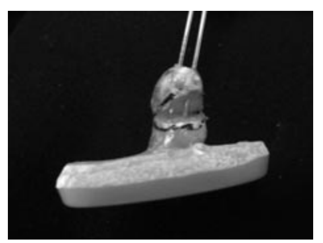
Fig. 2. Potted scaphoid model showing placement of parallel K-wires.

removed from the waist of each scaphoid to create the "humpback" deformity (Fig. 3) The dorsal cortex was left intact temporarily until the osteotomy was internally fixed to recreate the dorsal hinge.