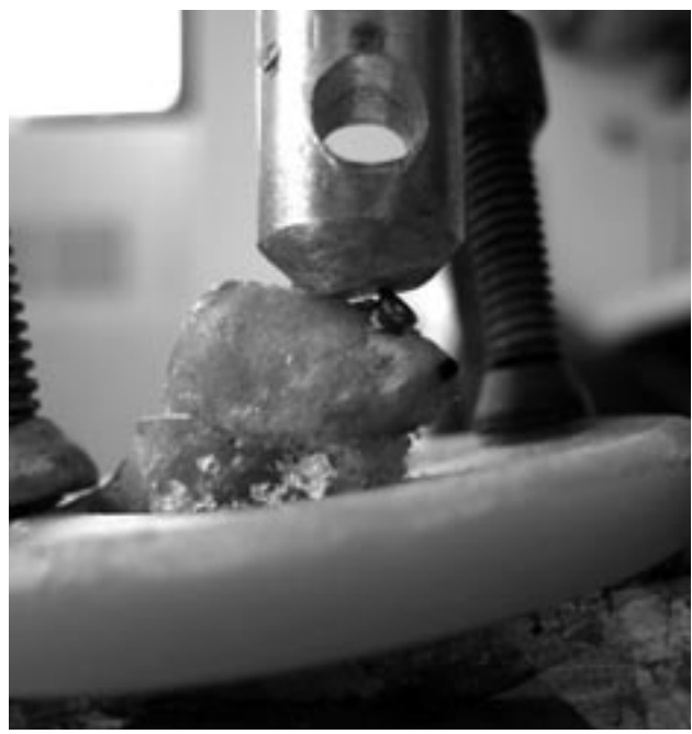
Fig. 5. Scaphoid model illustrating active compression producing displacement on the dorsal cortex between the proximal and distal aspects of the model.

(p<0.001) There was no statistically significant difference in strength between the two screws, although the trend was that the Standard type was stronger.