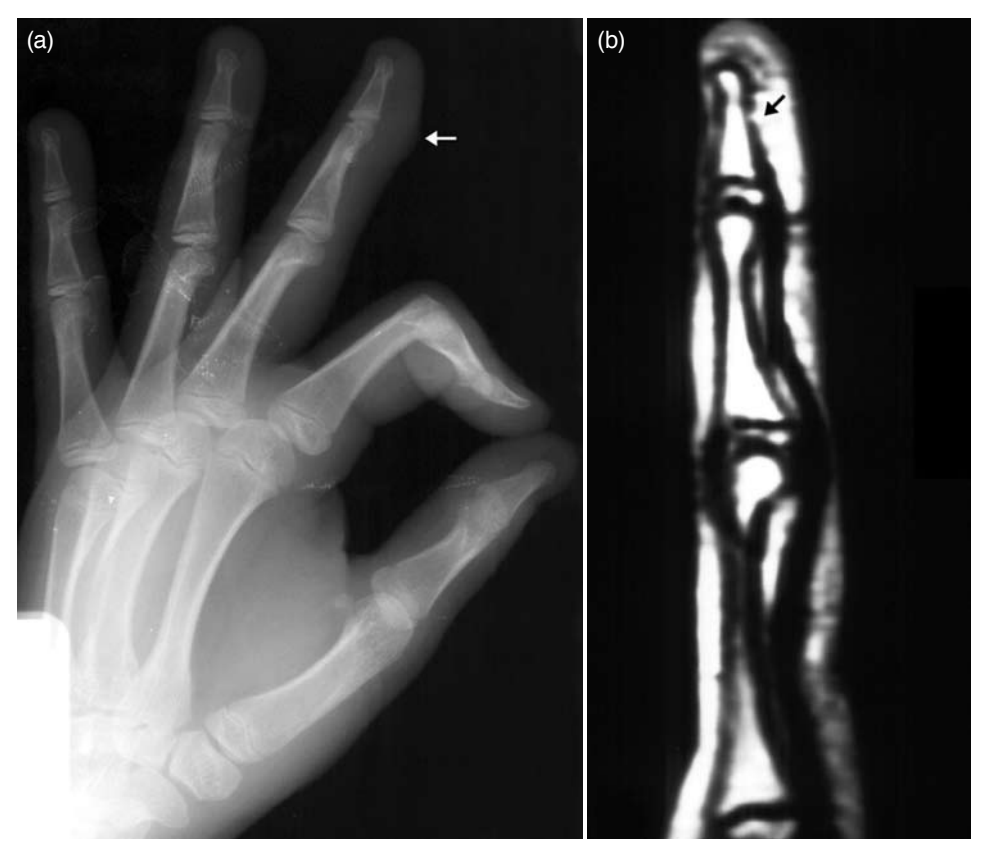
Fig. 1. (a) A preoperative radiogram of the patient showing a soft tissue swelling (arrow); (b) a magnetic resonance scan of the finger showing the extra-osseous tumor.

Malignant small-cell tumors represent 6% to 10% of all malignant bone tumors, ranking in the sixth place.<sup>[6,7]</sup> They are usually seen between the ages of 10 to 15 years and rarely seen over the age of 30 years.<sup>[8]</sup> Ewing's sarcoma usually involves the metaphyses or epiphyses. Primitive neuroectodermal tumors predominantly involve the diaphyses of the long bones together with central and axial skeleton.<sup>[9,10]</sup> Histological findings lack specificity; thus, differ-