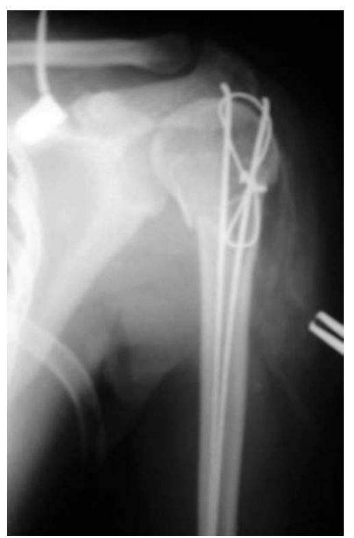
Figure 2. Intraoperative anteroposterior radiography of a two part fracture threated with AO tension-band technique.

which grades the outcome as excellent, satisfactory, or unsatisfactory.<sup>[13]</sup> The pain score was determined with a 10-point visual analog scale (VAS). Patients' data on the 6<sup>th</sup> and 12<sup>th</sup> month control visits were compared by Student t-test.