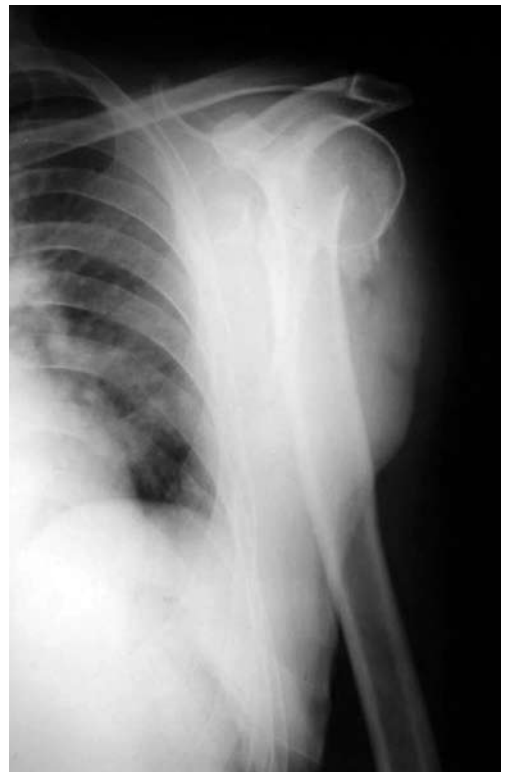
Figure 1. Preoperative anteroposterior radiography of a two part fracture.

branches. The upper ends of the K-wires were then cut, bent and hammered into the humeral head.