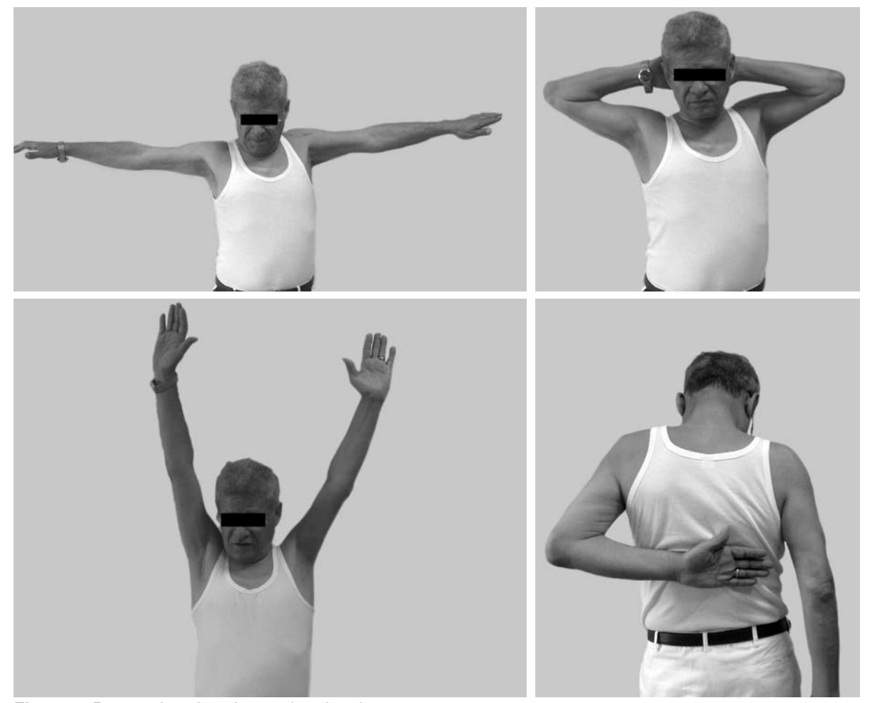
Figure 4. Range of motion six months after the surgery.

The results of the patients with regard to Constant score and Neer criteria were undifferentiated when the 6<sup>th</sup> and the 12<sup>th</sup> month data were compared (p<0.05). However, VAS scores of the patients between the two control visits showed statistically significant differences (p>0.05). In three patients significant shoulder pain and stiffness developed and those symptoms were treated with intensive physiotherapy. They were found to be normal at the 12th month assessment. Sixtyone patients regained at least 90° abduction and flexion (Figure 4). Mean range of motion value for abduction was 117.6° (range 73°-132°) and for flexion 121.2° (range 83°-146°). Sixty-three patients were able to perform daily activities that they had performed before the injury. All of the patients