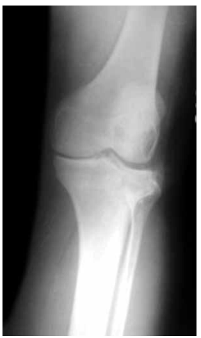
Figure 3. Postoperative 55 months anteroposterior X-ray.

reference point of posterior tibial cortex as described by Brazier et al.<sup>[7]</sup> (Figure 5a). The Caton index (CI) and Insall-Salvati index (ISI) were used for patellar height measurement.<sup>[8,9]</sup> On the lateral view; the superior and inferior tips of patellar articular surface and the anterosuperior angle of tibial plateau are marked for CI. The ratio of the distance from the inferior tip of the patella and anterosuperior angle of the tibia to patellar articular surface length is called CI (mean value 0.96±0.134) (Figure 5b). The ISI was measured as ratio of patellar tendon length to patellar length (mean value 1.02±0.2) (Figure 5c).