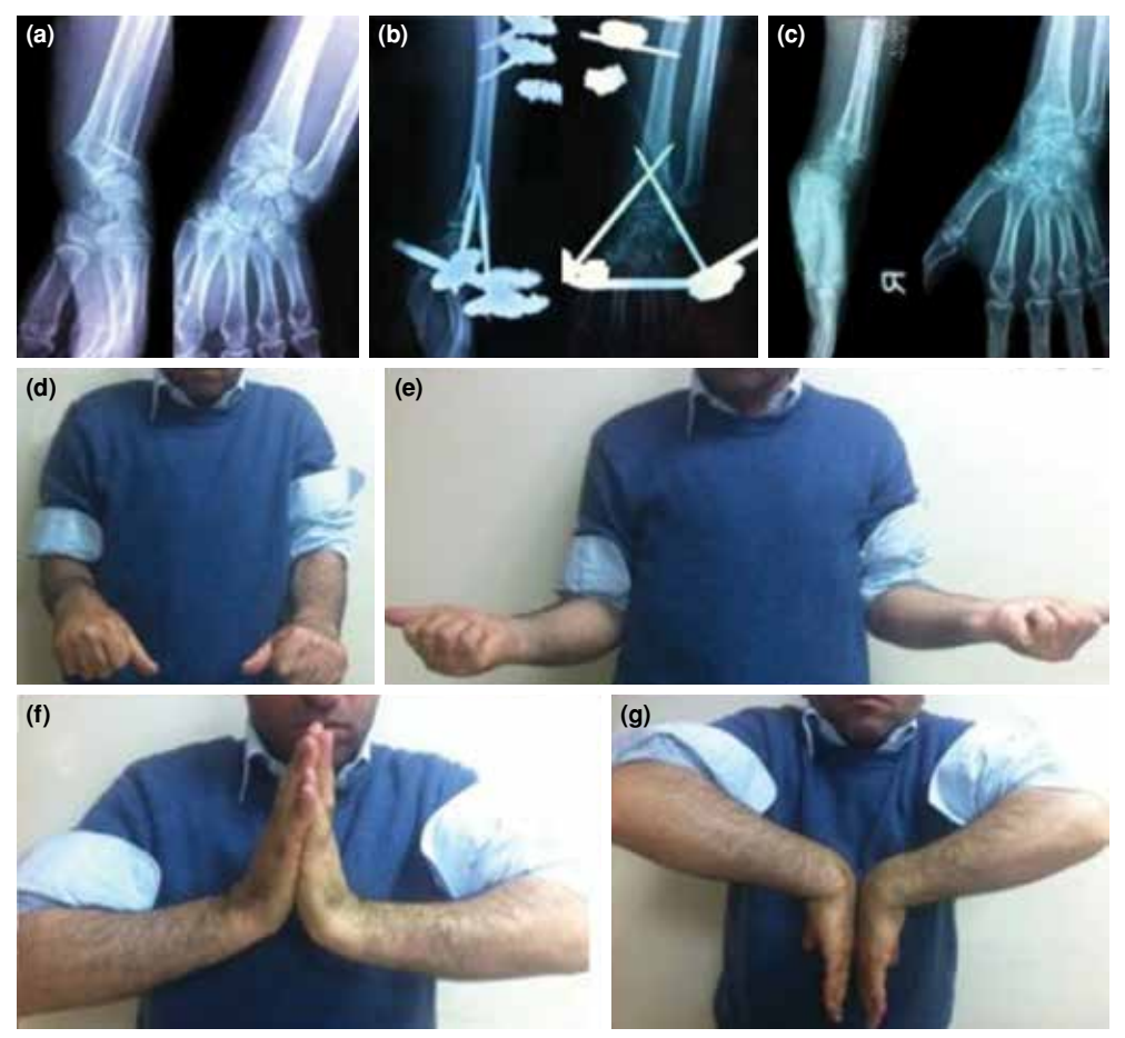
Figure 2. Pre-, early postoperative, and last follow-up radiographic images of wrist of a patient with non-bridging external fixator ( a-c ). The clinical picture of the patient at final follow-up ( d-g ).

The patients who were included in the study were called for a scheduled final follow-up visit. Thirty four of these patients were treated with a VLP (VLP group), 30 with a NbEF (NbEF group) and 31 with a BEF (BEF group).