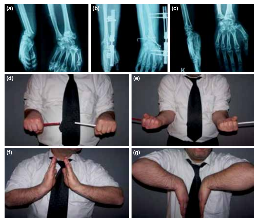
Figure 3. Pre-, early postoperative, and last follow-up radiographic images of wrist of a patient with bridging external fixator (a-c). The clinical picture of the patient at final follow-up (d-g).

expressed in median (IQR 25^{\text{th}} to 75^{\text{th}} ) for numerical variables and in number and frequency for categorical variables. Numerical variables were compared using the Kruskal-Wallis and Dunn's test in more than two groups, as they did not meet the normal distribution condition. The ratios were compared using the chi-square test. A p value of <0.05 was considered statistically significant.