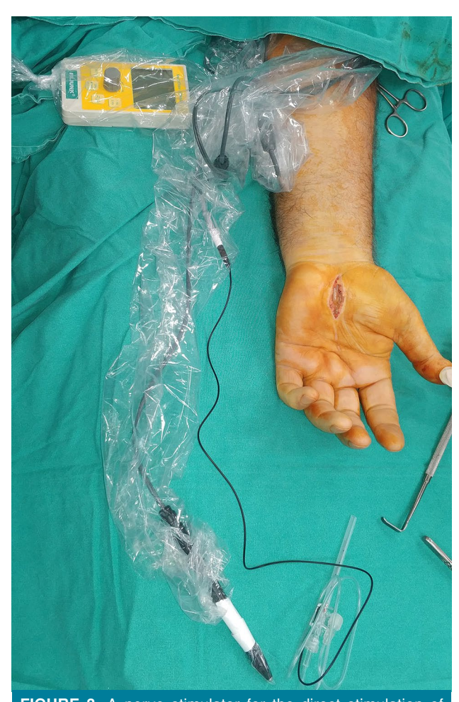
FIGURE 3. A nerve stimulator for the direct stimulation of the motor branch of the median nerve to observe muscular contraction on the adductor pollicis brevis.

Statistical analysis was performed using the Jamovi Project 2.2.5.0 (retrieved from https://www.jamovi. org) and JASP 0.16.1 software (Jeffreys' Amazing Statistics Program, retrieved from https://jasp-stats. org) software. Continuous data were expressed in mean \pm standard deviation (SD) or median (min-max), while categorical variables were expressed in number and frequency. The Shapiro-Wilk, Kolmogorov-Smirnov, and Anderson-Darling tests were used to