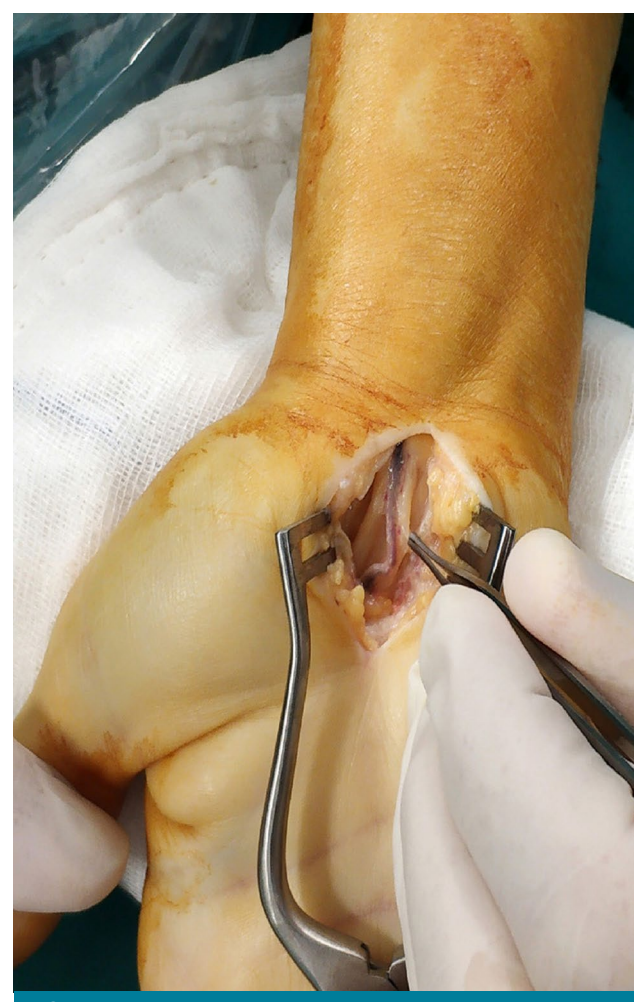
FIGURE 1. Isolation of the median nerve's motor branch in a carpal tunnel syndrome patient.

A single experienced hand surgeon performed all CTR procedures. A 2-cm long incision starting proximal to Kaplan's cardinal runs along the ulnar edge of thenar crease to wrist crease. During the procedure, the motor branch of the median nerve was exposed (Figures 1 and 2) and stimulated with