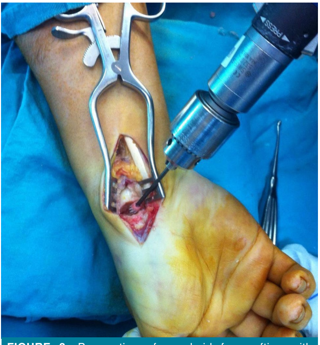
FIGURE 3. Preparation of scaphoid for grafting with high-speed burr.

was not good enough, we used Kirschner wires (K-wires). The use of K-wires was required for two patients. Positioning was confirmed with fluoroscopic evaluation. Afterwards, under a microscope, artery repair was performed end-to-side into the radial artery and venous repair was performed end-to-end into the accompanying veins. Perfusion of the graft was visually confirmed by releasing the tourniquet before closure (Figure 6).