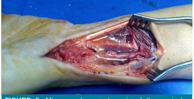
FIGURE 6. Microvascular anastomosis of the genicular artery end-to-side into the radial artery and anastomosis of a concomitant vein end-to-end with a radial vena comitans.

were smoker. The mean nonunion duration was 38.5\pm59.5 (range, 6 to 204) months and the mean follow-up was 22.4\pm5.8 (range, 14 to 33) months.