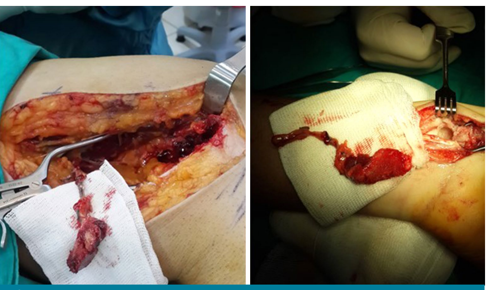
FIGURE 5. Harvesting of the free vascularized medial femoral condyle bone graft.