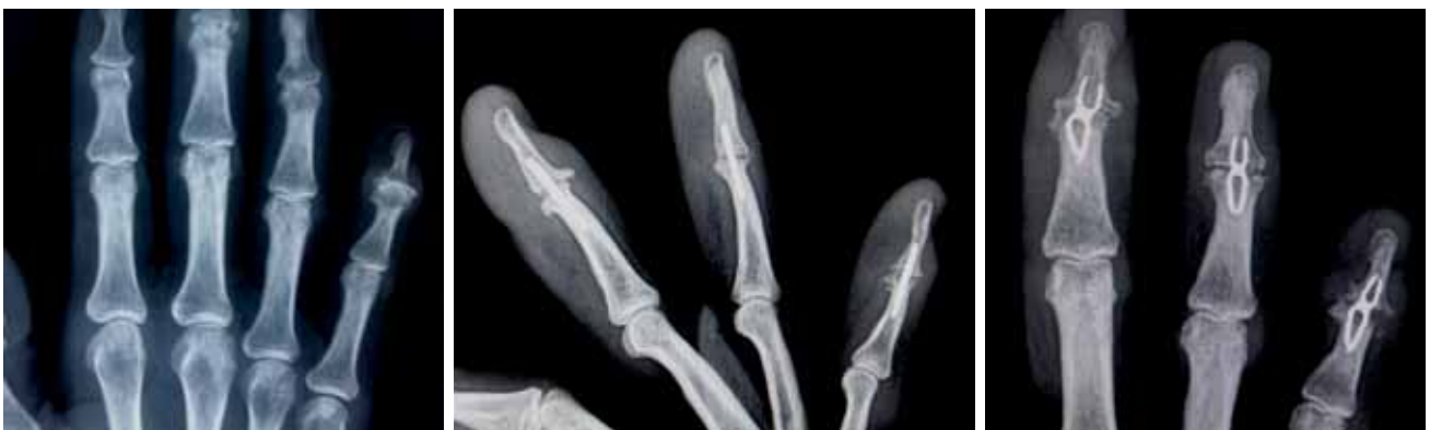
Figure 3. Pre- and postoperative X-rays after arthrodesis (anteroposterior and lateral).

Documented union rates associated with DIP and IP joint arthrodesis of the hand vary widely in the