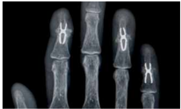
Figure 2. Postoperative X-ray six months after arthrodesis of three distal interphalangeal joints showing fusion.

For all patients, X-ray results were obtained at the previously mentioned intervals. Of the implants, 95% (n=39) resulted in bony fusion within the first postoperative three months. Failure of fusion occurred only in two joints (5%). For one of these cases, the implant was removed and a revision was undertaken using a cannulated screw and autologous cancellous bone graft. For the other case, the implant