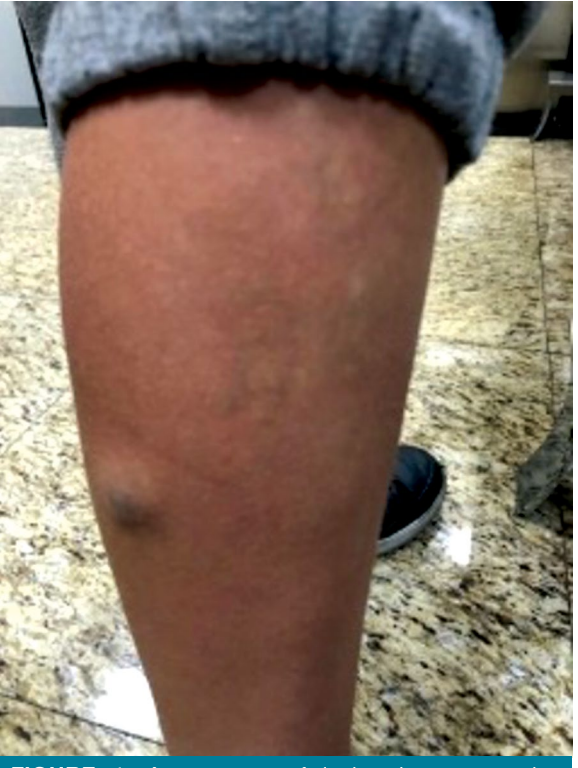
FIGURE 1. Appearance of lesion in preoperative physical examination.

composed of vascular channels and papillae with hyalinized cores (Figure 2a). Vascular channels and papillae were lined with cluster of differantiation (CD)34-positive endothelial cells (Hobnail cells) that were projecting into the lumen (Figure 2b). Surgical margins were free of tumor. Since the lymph node metastasis of the tumor was previously described