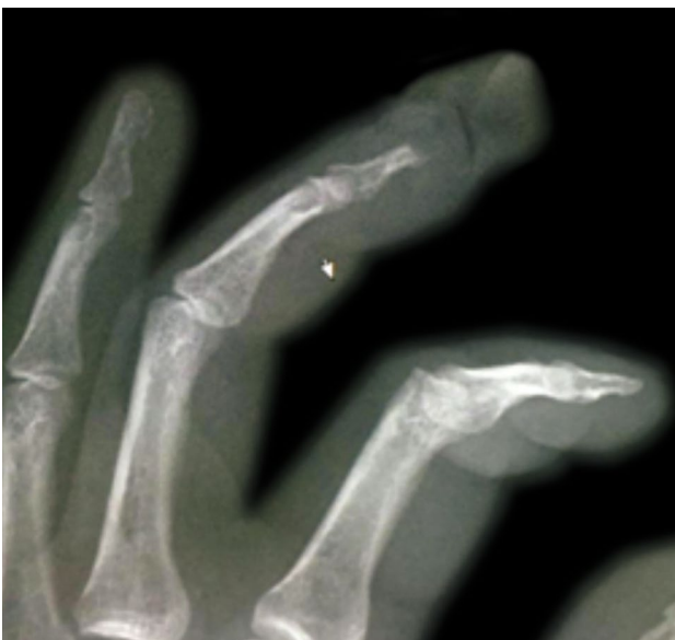
FIGURE 4. A postoperative oblique radiograph confirming the partial excision of distal phalanx at an appropriate level.

The patient and/or her family were informed that data from the case would be submitted for publication and gave their consent.