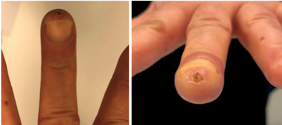
FIGURE 1. Splinter injury of the third phalanx of middle finger of left hand with pain and discharge.

sedimentation rate (ESR) 17 (0-20) mm/h, and C-reactive protein (CRP) 0.000785 (0-0,005) g/L. Physical examination and radiographs revealed osteomyelitis of the distal phalanx (Figure 2). Severe tenderness over the distal volar pulp on palpation and minimal discharge from the entry site of the splinter. Surgical treatment was decided, and a written informed consent was obtained from the patient.