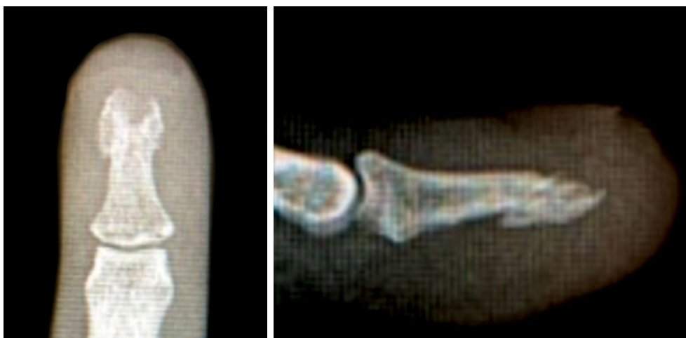
FIGURE 2. Anteroposterior and lateral radiographs showing local osteolysis due to osteomyelitis of distal phalanx.

showed an abundant number of neutrophils (polymorphonuclear neutrophil leukocytes) with no microorganism. Bacterial and fungal cultures were incubated and regular-shaped colonies with white to cream color were seen at 72 h of incubation in the blood agar and sabouraud dextrose agar. Using the matrix-assisted laser desorption/ionization time of flight mass spectrometry (MALDI-TOF-MS; VITEK®; bioMérieux Diagnostics, France), C. lusitaniae was isolated. The antifungal susceptibility was tested via the VITEK® 2 (bioMérieux Diagnostics, France) antimicrobial susceptibility testing. The culture analysis showed production of C. lusitaniae and the pathological examination result was reported as superficial tissue characterized by parakeratosis and squamous hyperplasia. Postoperative laboratory testing showed normal ESR and CRP levels with a