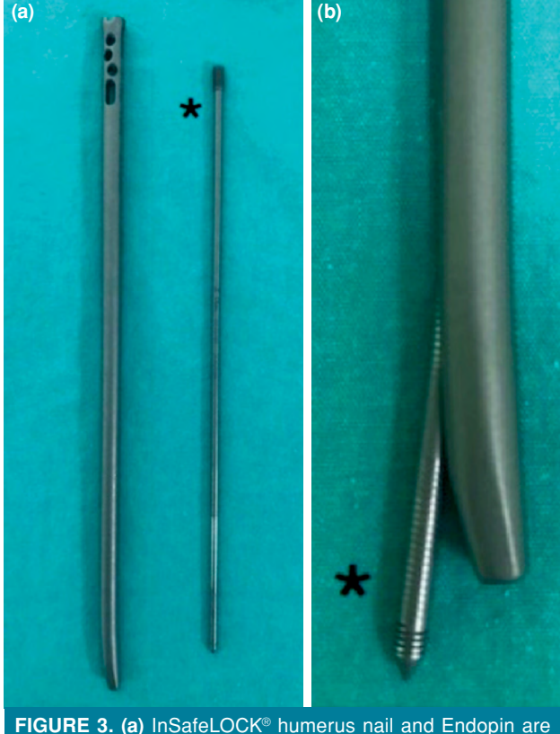
demonstrated. (b) Endopin is mounted inside InSafeLOCK<sup>®</sup> nail.

Intramedullary nails can be used primarily in the surgical treatment of many types of humeral fractures or secondary in nonunion cases.<sup>[3,5,12,13]</sup> There are some studies that report shoulder dysfunction after humerus intramedullary nailing while these studies indicate that these problems are mostly related to chondral damage or prominent nail end.<sup>[2,14]</sup> Verdano et al.<sup>[15]</sup> have evaluated shoulder ultrasound studies of patients with antegrade nailing and stated that there was no relationship between the rotator cuff tears and the subjective complaints of the patients. It has been shown that the incidence of postoperative problems related to rotator cuff irritation or tears was higher in bent nails than straight nails.<sup>[16]</sup>