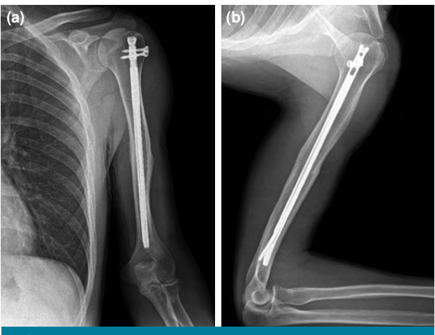
FIGURE 2. (a, b) Anteroposterior and lateral radiographs of same patient at postoperative 17.5 months.

90° while the forearm was supine before the internally safe locking pin screw (TST Tibbi Aletler San. ve Tic. Ltd. Sti., Istanbul, Turkey) was introduced. Lateral side of the nail holder was aimed at the lateral epicondyle. The distal-posterior cortex was drilled with the help of a 3x400 mm K-wire using a surgical motor. The Endopin was sent into the nail channel by its special screwdriver (2.5×200 mm). The Endopin was advanced distally by rotating its screwdriver clockwise and inserted in the posterior cortex. Thus, distal locking was achieved both by inserting the threaded end of the Endopin into the posterior cortex and by compressing the distal end of the nail to the anterior. The elapsed time for distal locking was noted (from the moment when the K-wire was advanced to the nail channel until distal locking procedure was completed). Then, proximal locking procedure was carried out. Locking was performed through the targeting guide using at least one of the holes designed as static transverse, static angled, dynamic compression, and calcar screw for locking on the nail at the proximal. After the locking