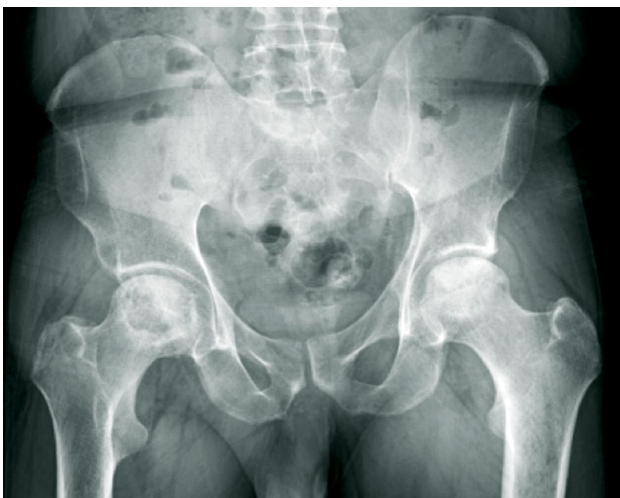
FIGURE 1. Anteroposterior view of pelvis showing flattening of outer portion of bilateral femoral head from avascular necrosis, with adjacent joint space narrowing.

Our case is a 34-year-old male patient who was operated for a non-secreting pituitary macroadenoma