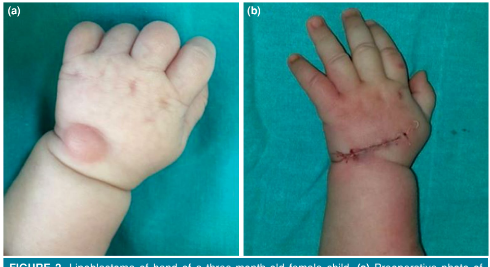
FIGURE 2. Lipoblastoma of hand of a three-month-old female child. (a) Preoperative photo of dorsal hand mass. (b) Postoperative photo of hand.

As seen in our study, tumor and tumor-like lesions of the hands are mostly benign pathologies. Similar results were reported for the adults in some studies.<sup>[7,8]</sup> There are some different findings from the literature in the current study. One interesting result was the non-dominance of the gender for the ganglion cyst. The prevalence of the ganglion cyst was reported higher in the female gender.<sup>[3,4]</sup> However, the rate was found to be equal for each gender (50%-50%) in our study. To our knowledge, there is no study