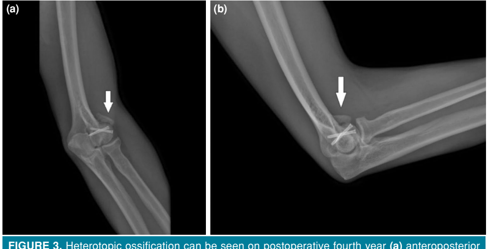
FIGURE 3. Heterotopic ossification can be seen on postoperative fourth year (a) anteroposterior and (b) lateral radiographs of a 46-year-old male patient.

system introduced by Grantham (Table V), which takes the patients' stability, pain, and ROM into account.<sup>[9]</sup> According to this evaluation, excellent results were obtained in five patients, good results in five, moderate results in seven, and poor results in four.