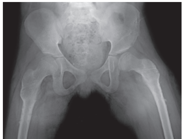
Figure 3. Follow-up radiograph of a patient after bilateral femoral varus derotation osteotomy and Dega transiliac osteotomy.