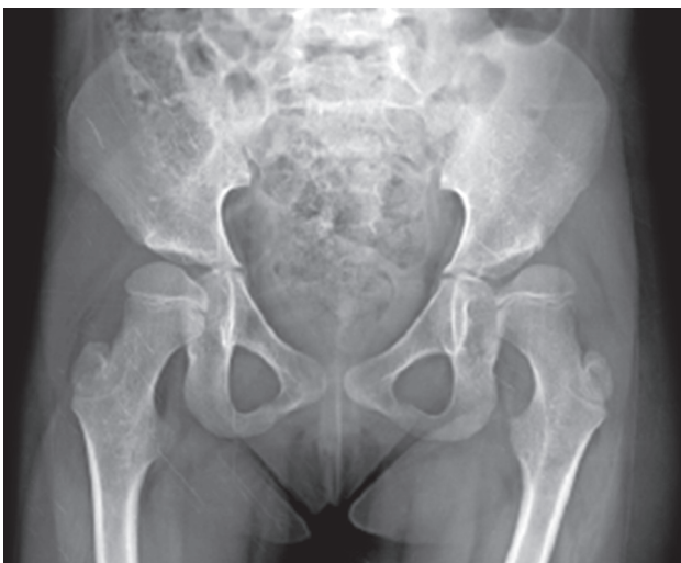
Figure 1. Preoperative radiograph.