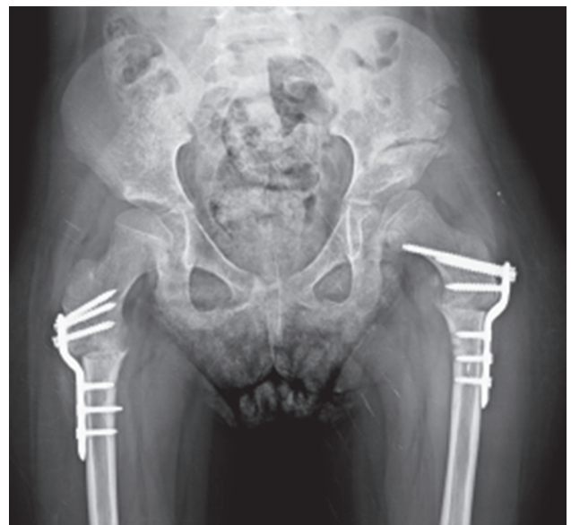
Figure 2. Postoperative radiograph of a patient after bilateral femoral varus derotation osteotomy and Dega transiliac osteotomy.

All patients were treated with femoral VDRO with Dega transiliac osteotomy as part of single event multilevel surgery. Femoral VDRO was performed at the level of lesser trochanter. All osteotomies