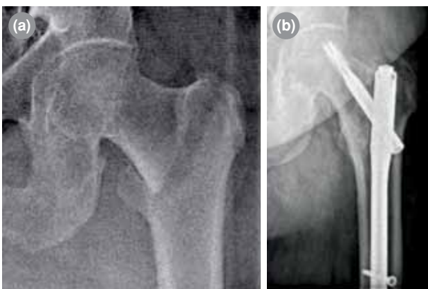
Figure 1. A 72-year-old female patient with left femur intertrochanteric fracture. She was treated with proximal femoral nail-antirotation. (a) Preoperative roentgenogram. (b) Postoperative 24 th month roentgenogram.

Patients in both groups were compared according to mortality rates, age, gender, mechanism and type of fracture, type of anesthesia, duration of operation, amount of intraoperative blood transfusion, duration of hospital stay, functional outcome of Harris hip score, data from Short Form 36 (SF-36), postoperative complications, revision rate, and cost of operation.